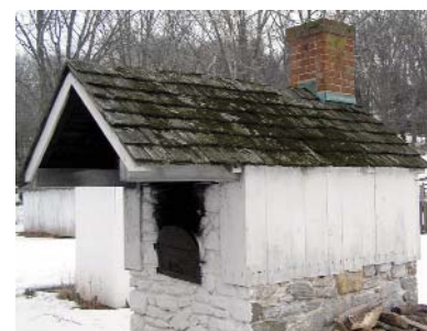
This is the bake oven we will be installing a slate roof on.